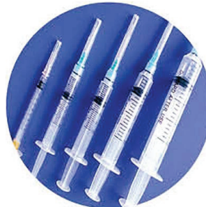
safety syringe with retractable needle