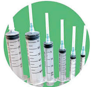
3-parts luer lock disposable syringe