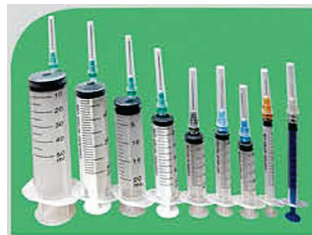
luer slip syringes