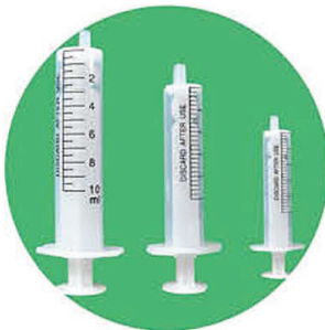
2-parts disposable syringe