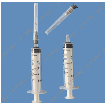
5ml luer slip with needle