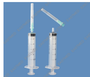
10ml luer slip with needle