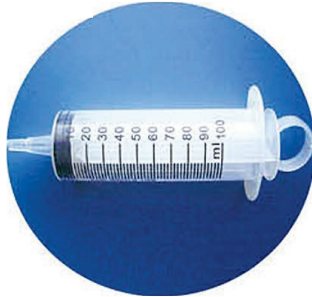
100ml catheter tip syringe