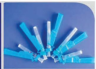
safety needle General use