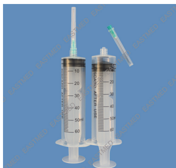
50-60ml luer lock with needle