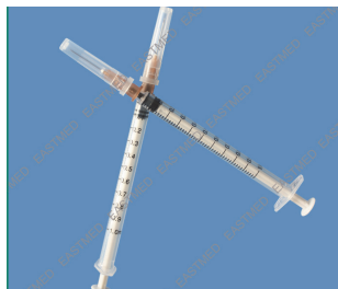
1ml tuberculin syringe