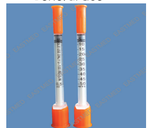
1ml insulin syringe